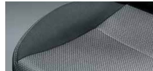
FABRIC WITH SILVER STITCHING (SZ4, SZ-T)