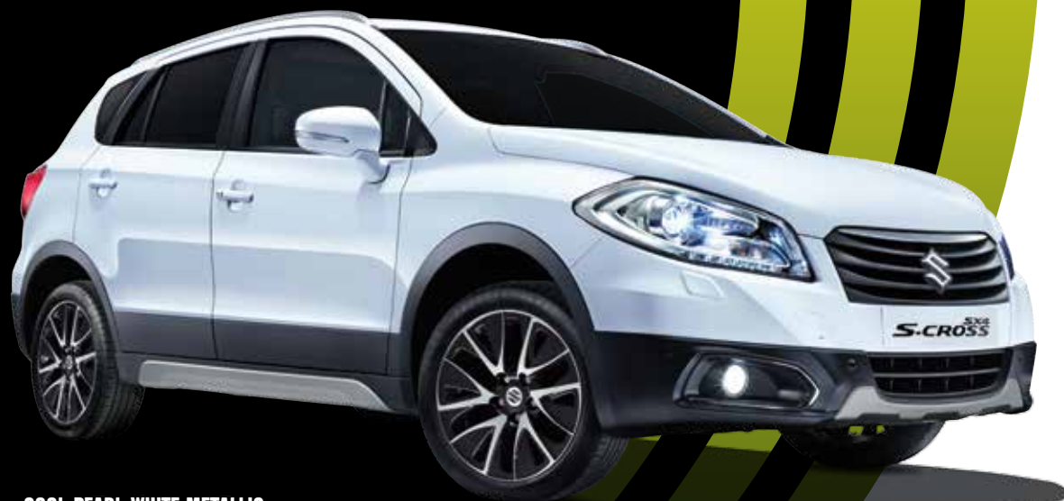
COOL PEARL WHITE METALLIC