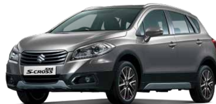
GALACTIC GREY METALLIC