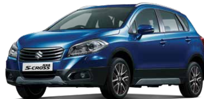
BOOST BLUE PEARL METALLIC