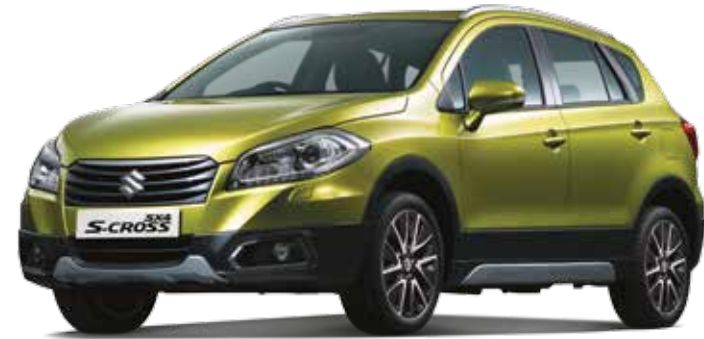
CRYSTAL LIME METALLIC