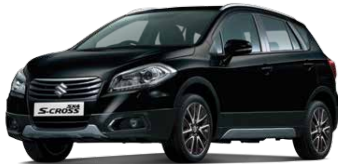
COSMIC BLACK PEARL METALLIC