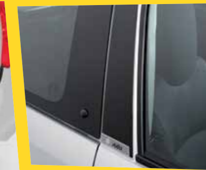
B PILLAR TRIM SET