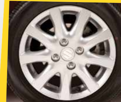
FARO ALLOY WHEEL