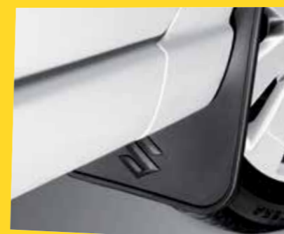
FLEXIBLE MUDFLAP SET