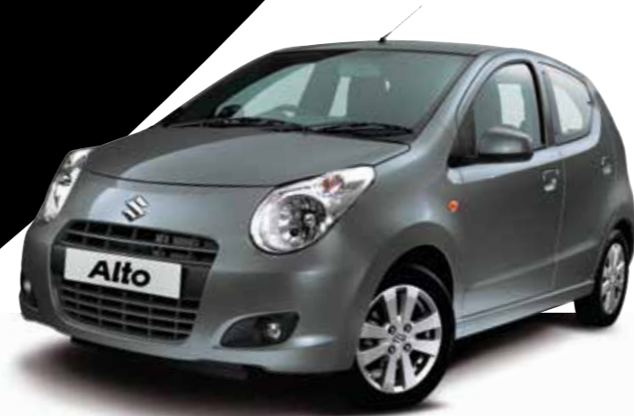
GLISTENING GREY METALLIC