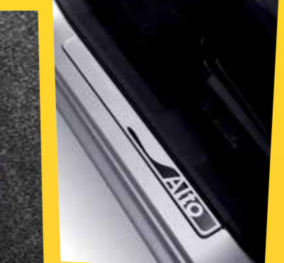
DOOR SILL TRIM SET