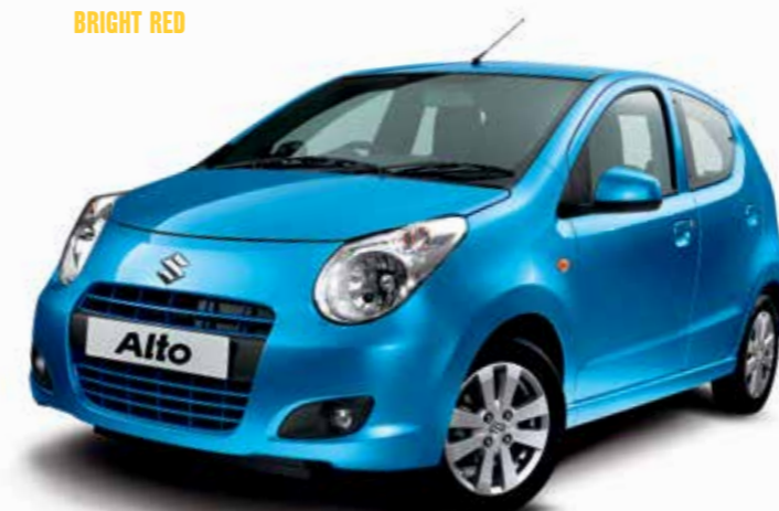
PARADISE BLUE PEARL METALLIC