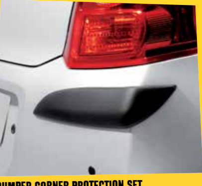
BUMPER CORNER PROTECTION SET