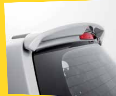
REAR UPPER SPOILER

Make your Alto an extension of your personality with this selection of stunning accessories that you can mix and match. You'll find the entire range on our website, so for once, we're going to suggest you let your fingers do the walking to: www.suzuki.co.uk/cars/accessories