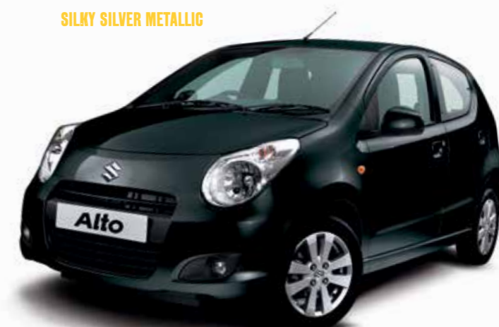
MIDNIGHT BLACK PEARL METALLIC