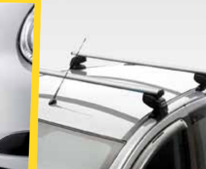
MULTI ROOF RACK