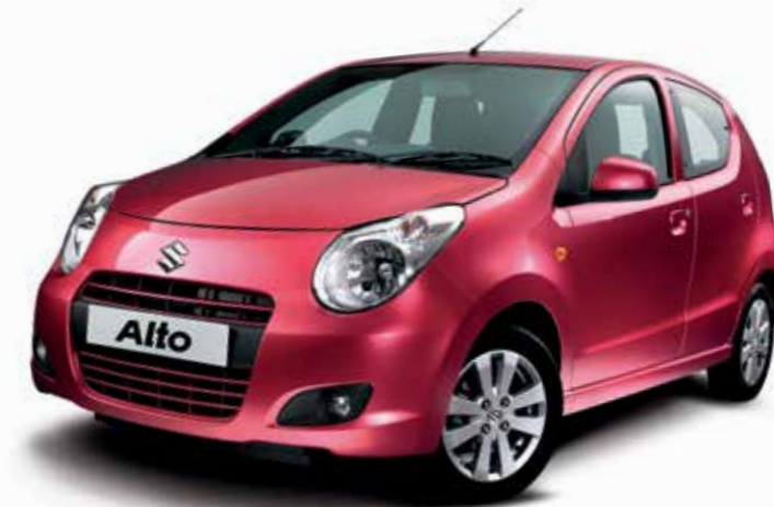
FORTUNE ROSE PEARL METALLIC