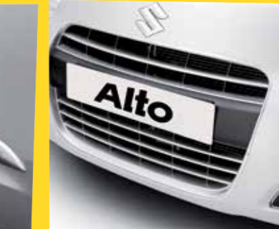
CHROMED GRILLE SURROUND