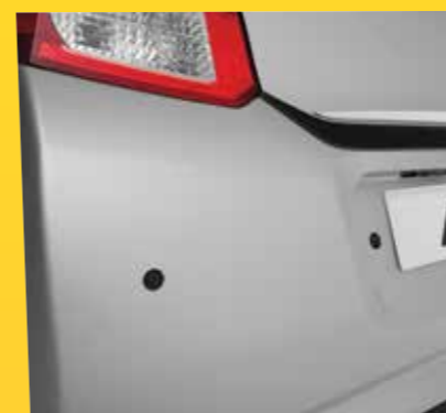
REVERSING AID SENSOR KIT