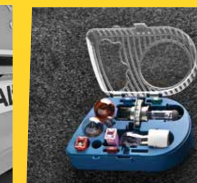
SPARE BULB AND FUSE KIT