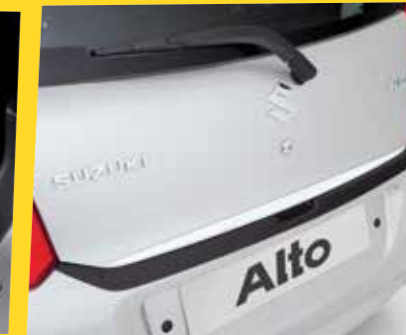
REAR BUMPER TOP GUARD