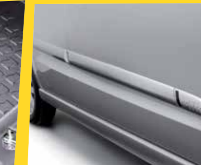
SIDE BODY MOULDING SET